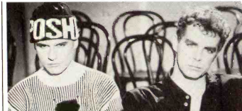
Pet Shop Boys