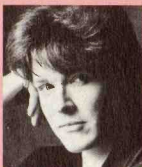
David Sylvian - first live tour in four years

Globe Theatre, Shaftesbury Avenue, London W1, tel 1-4377122