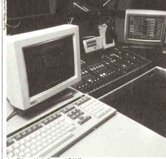
Jazz FM uses Media Touch and DAMS

"The hinged loading on the 730 gives the DJ fast access to change discs and it can also be flush-