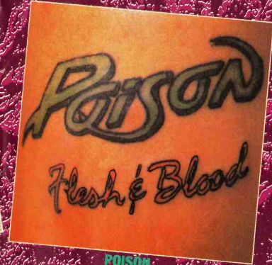
FLESH & BLOOD