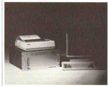
Audisk digital audio recorders can be used to link individual stations by

To contact Music & Media Tel: 31 20 669 1961 Fax: 31 20 669 1931 (sales)