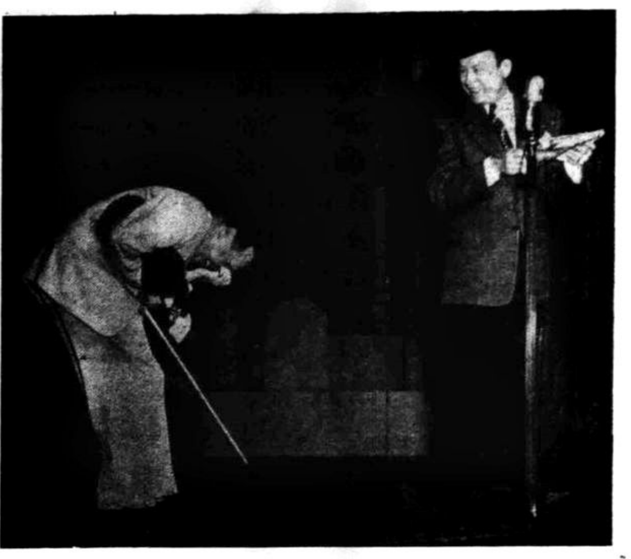
HOW FUNNY CAN YOU GET? Jack Benny's reaction to fast-talking Fred Allen. Benny, clutching his beloved violin, doubles up with amusement at one of Allen's jokes on a vacation-time theatre date.

new contract terms, but I understand that the Capitol and Strand theatres are also negotiating for similar terms with their band attractions.