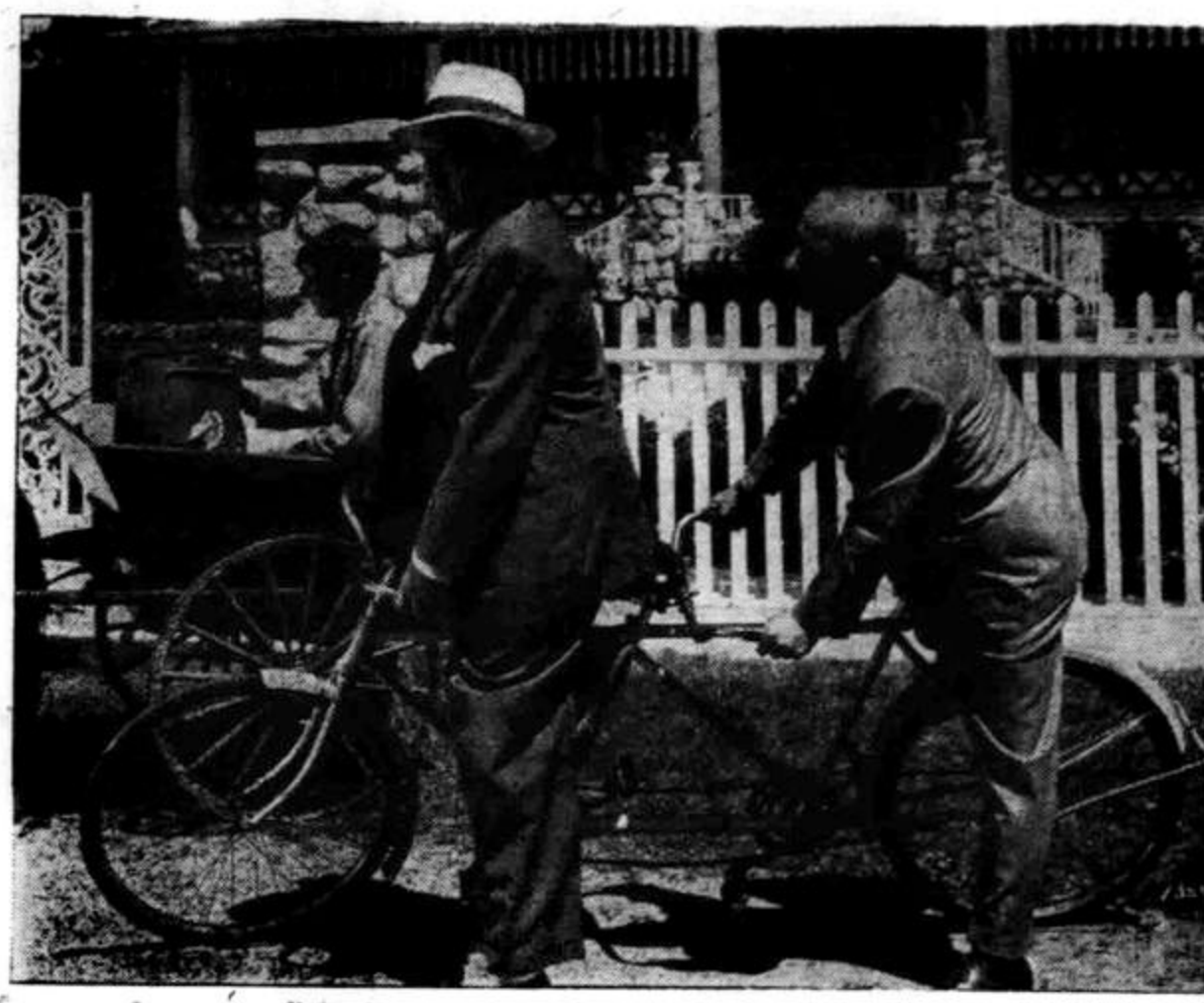
Latest picture of Lauritz Melchior and Jimmy Durante taken on the set of M.G.M.'s "This Time For Keeps."

Lauritz Melchior, the world's foremost tenor, and Jimmy "Schnozzola" Durante, he of the gravel voice and the most famous nose extant, are buddies in one of the most incongruous friendships in the history of the Hollywood film colony.