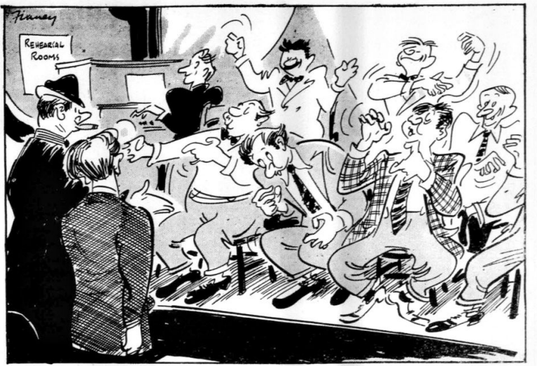
"This is just a rough idea—it'll sound much better if you engage them because then they'd be able to buy the instruments!"

TO BE OR NOT TO BE COMMERCIAL—Since the middle Twenties, and perhaps even before that, jazz, jazz jazz, has been the breeding ground of progress in popular dance music.