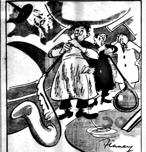
"I'm not so sure this 'Music While You Work' is such a good idea for THIS workshop."