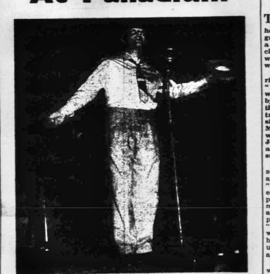
Exclusive "Musical Express" picture of Tony Martin taken at rehearsal at the Palladium.

TONY MARTIN had a spectacular success when he opened on Monday of this week at the London Palladium. But then we are familiar with this handsome young movie-radio star from America. He has the voice, the looks, the appearance and the manner. But you've got to go to the Palladium to see how they put on their bills in that house. You must see the magnificent "drags" set they have constructed for Tony Martin.