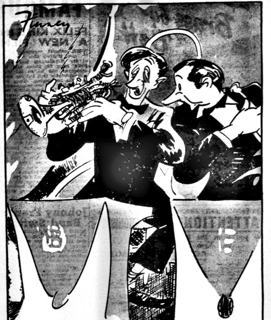
"After tonight I'll simply HAVE to put it in for repair!"