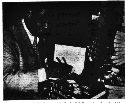
Duke Ellington, in his dressingroom at the London Palladium, autographs copies of his biography for his publishers, Musicians Press.