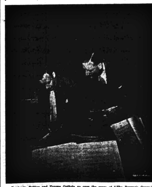
Benjamin Britten and Tyrone Guthrie go over the score of "The Beggar's Opera" prior to the continental premiere in Amsterdam.