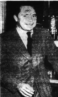
Ray Anthony, whose aggregation has come to the fore as America's top dance band, chats with famed songwriter, Johnny Mercer, who is also an executive of Capitol Records, the firm for which the Anthony orchestra records.