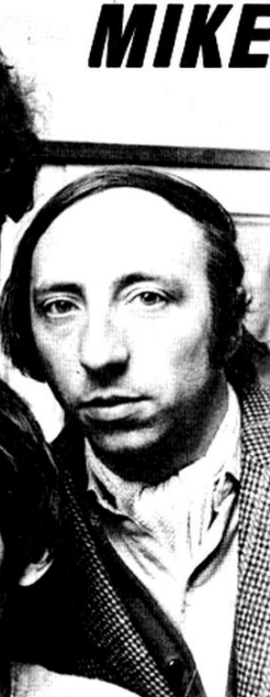
SCAFFOLD (l to r) ROGER MCGOUGH, MIKE MCGEAR and JOHN GORMAN.

I mentioned that various members of the Scaffold were occasionally being seen as individual entertainers, and did it mean they were going their separate ways. "No, definitely no," said Mike. "And not only that but no."