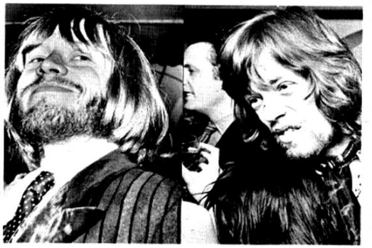
Beards are "in" this year, with the Rolling Stones among the principal trend-setters! BRIAN JONES (left) was pictured at the reception to launch Grapefruit, the group sponsored by the Beatles. MICK JAGGER, newly returned from a South American holiday, is seen at the Duke of Bedford's party in honour of Diana Ross and the Supremes.

Tom filmed for Cilla TV No. 2 TOM JONES—who leaves for America tomorrow (Saturday) on the first stage of his major U.S. cabaret and concert tour—will have his departure from London Airport filmed by BBC-1 cameras for inclusion in Cilla Black's show next Tuesday (6th). Tom was the guest star in the first edition of "Cilla" this week. Tom's flight to America has been brought forward one week to enable him to undertake two new engagements. He spends Monday and Tuesday in New York, filming his own TV spectacular, sponsored by Kraft Cheese. He then flies to Miami for a three-day cabaret appearance at the Deauville Hotel on Thursday, Friday and Saturday. Tom subsequently returns to New York to prepare for his Copacabana opening on February 15.