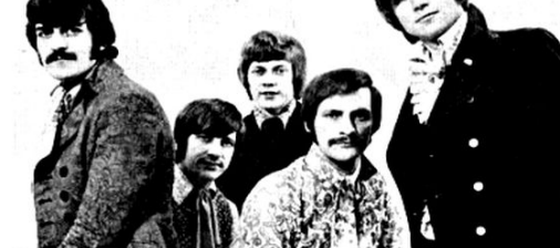
THE MOODY BLUES (l to r) RAY THOMAS, GRAEME EDGE, JOHN HODGE, MIKE PINDER and JUSTIN HAYWARD.

Grame Edge the groups' drummer and Justin Hayward their vocalist met me in a London pub recently, to discuss the single which has been so agonisingly slow in getting away. "Originally we wrote three numbers—'In A Silent Way', 'Hour' and 'Nights In White Satin'—quite independently but the link was so obvious that we put them together on the album," said Graeme.