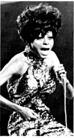
DIANA ROSS in action at London's Talk Of The Town.