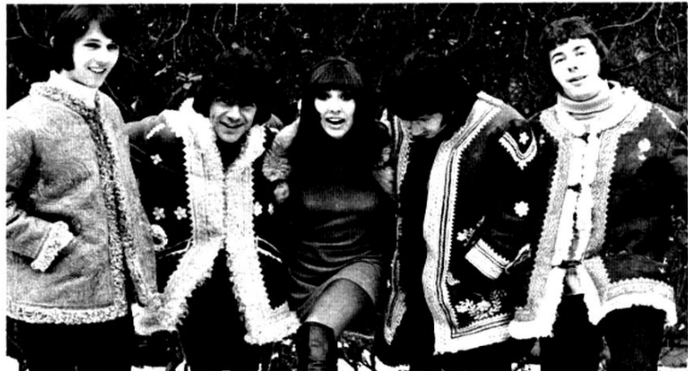
sitting way up there in the NME Chart.