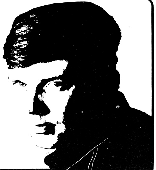
chart climber pictures of matchstick men- status quo