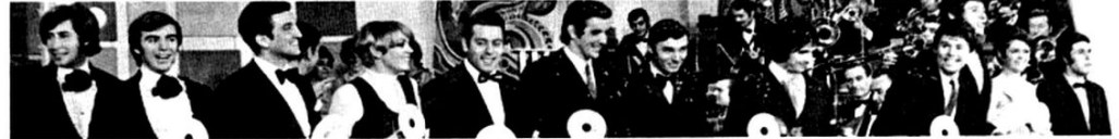
World star line-up (l to r) two of the ROKES (Italy), VICK VUKOV (Yugoslavia); CATERINA CASELLI (Italy); GERT TIMMERMAN (Holland); WILL TURA (Belgium); KAREL GOTT (Czechoslovakia); Roberto Carlos (Brazil); RAPHAEL (Spain); UDO JURGENS (Austria); WENCHE MYHRE (Germany); and ADAMO (France-Belgium), at the final Trophies Gala at Cannes.

THANK God for Tom Jones! That's what Britons were saying after he had stopped the show in the biggest star gathering of a week of stars at MIDEM—the Trophies Gala last Saturday. I've never heard him sing with such depth and feeling and he had the audience begging and cheering for more.