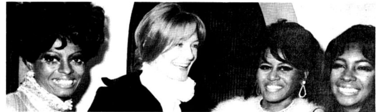
The SUPREMES (l to r) DIANA ROSS, CINDY BIRDSONG and MARY WILSON with film actress VANESSA REDGRAVE, who says she wants to be a pop star. They met at a party in Chelsea hosted by the Duke of Bedford.

YOU could see it: the Supremes were overwhelmed. They sat there in the room and hit back with answers as best they could. Reporters and photographers loomed over them, whispered questions in their ears, passed notes, waved microphones, asked about their love life, and generally told the three of them just how wonderful they were. (Which is true enough!)