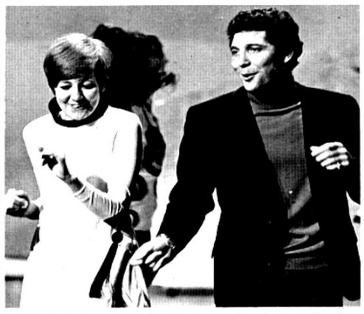
CILLA BLACK and TOM JONES pictured rehearsing their "It's Not Usual" routine, which was one of the highlights of Cilla's first BBC-1 spectacular on Tuesday.