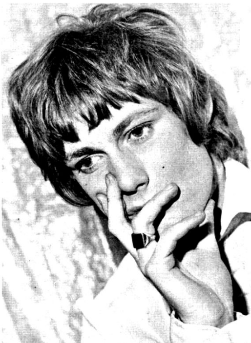
And things that would drive them round the bend.

"Sometimes I can be rather moody, I suppose, but I think on the whole I am easy going. I am extremely untidy. If anybody was living with me they would probably