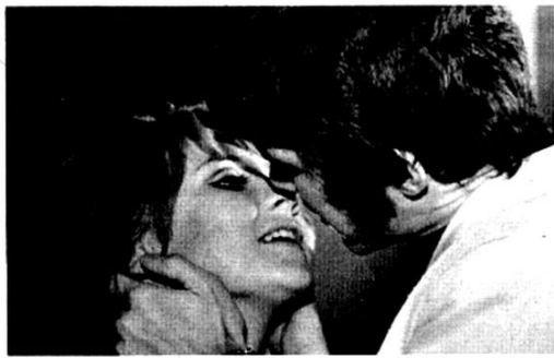
Last week Alley Cat said LULU refused to kiss DAVE CLARK—but here they are in the clinch that had their lips meeting—and both enjoyed it very much! But this is for the "Hold On" TV film, not for a "Daily Sketch" picture!