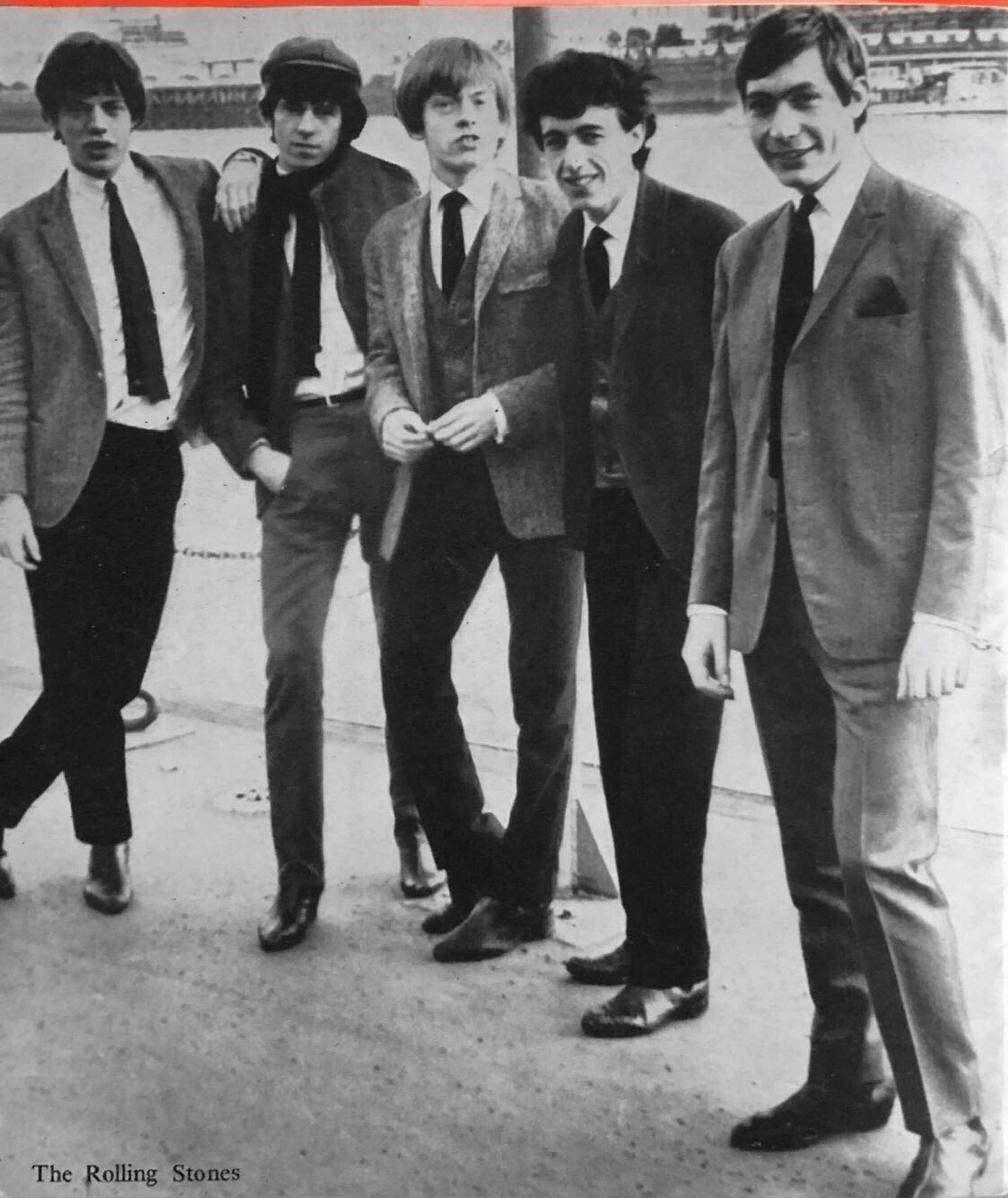
The Rolling Stones