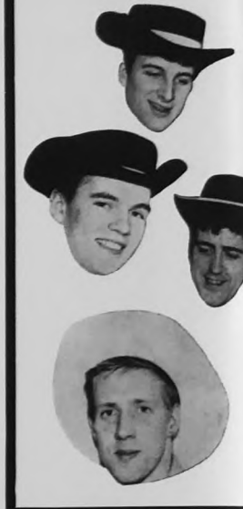
THE OUTLAWS The Return