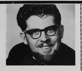
ROLF HARRIS Johnny Day COLUMBIA 45-DB4979