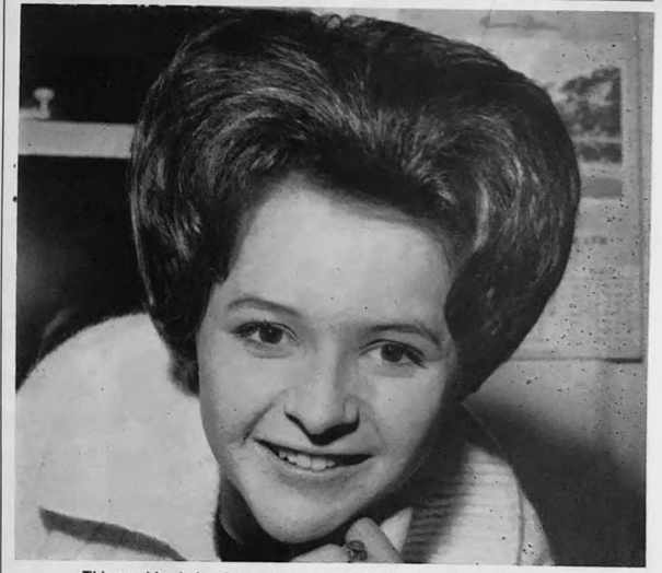
This week's choice from the second half of the chart BRENDA LEE.