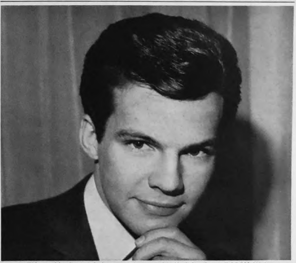
This week's picture choice from the second half of the chart: BOBBY VEE