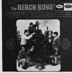
CAPITOL ST2164 (stereo LP) T2164 (mono LP)

H.M.V. CSD1579 (stereo LP) CLP1819 (mono LP)