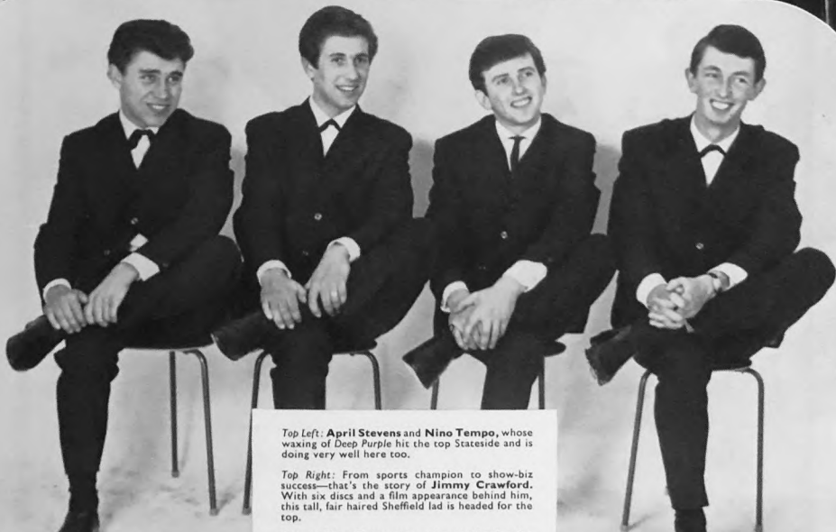
Top Left: April Stevens and Nino Tempo, whose waxing of Deep Purple hit the top Stateside and is doing very well here too.