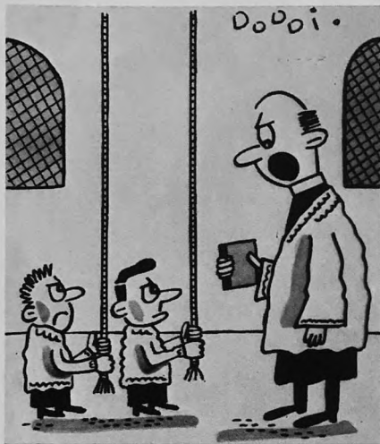
"Stop playing 'DoWah Diddy Diddy!'"