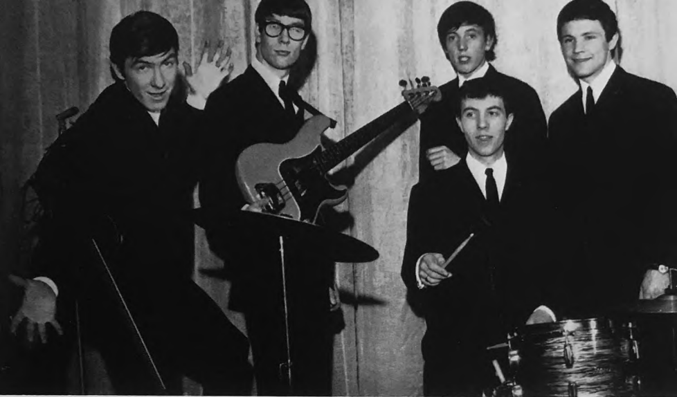
THE MOJOS, who have had a great time on THE STONES Tour.