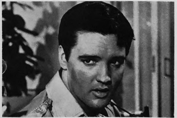
An early leader in several sections of our Poll, ELVIS

There are still, we think, one or two surprises to come!