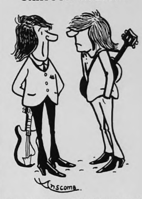
"I wonder if she will still love me without my make-up and high heels?"