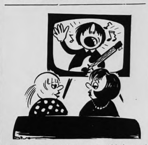
"His Singing is fab, I wonder if he's good looking?'