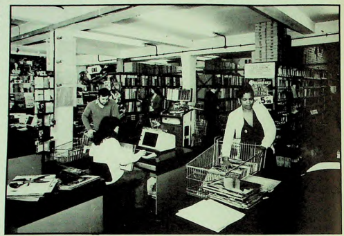
LIGHTNING'S IMPROVED cash and carry department, featuring newly installed VDU's at all check out

specialisation by the shrinking market, the two