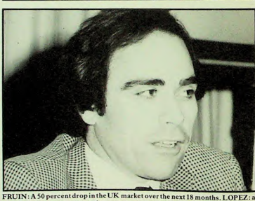
levelling out or even some gain

Gray estimated that trade would decline in excess of 10 percent, on the first quarter of 1980 which showed a 25 percent dip on 1979, but less than 20 percent. "The summer slump is probably not worse than last year although there were stronger releases on the mar-