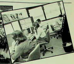
THE MUSIC Sales racks take up little space. Top: The sales staff sell in the titles like records.