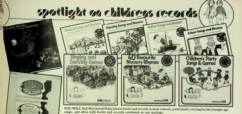
ADULT THRILLER writer Raold Dahl also produces childrens records for the Caedmon label

scruffy, multi-headed scarecrow called Worzel Gummidge - alias Jon Pertwee.