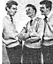
THE KING BROTHERS

The group is enjoying success with their most recent Parlophone record issue—"Put A Light In The Window" and "Miss Otis Greets" on R. 4389.