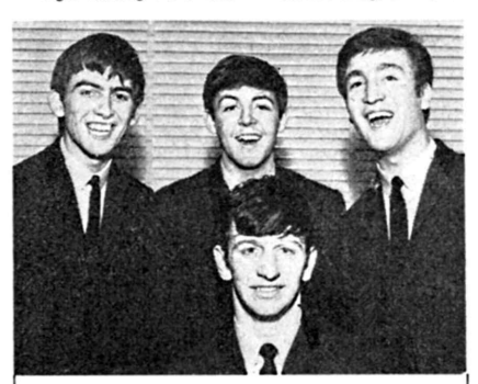
THE BEATLES Please Please Me/Ask Me Why PARLOPHONE 45-R4983

He wrote the number on the other side . . . a brighter sound taken at a medium tempo. There's a nice contrast at times between smooth, mellow clarinet, and staccato strings and vibes.