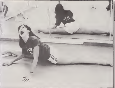
4. Some perticularly tricky manoeuvres "The Solits": can be fatal ...