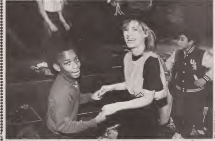
Everyone longot to be coal for a few hours when The Camiden Palace opened its doors and threw a Christmas tesperity for 250 load children. When it and meginations eargit be beforg vocals behind Junior's liver endition of "Mama Used" TO Sw". Coptan Sensible and Steve Strange joined in the party games and had s level aught the floor and compared check to check with the superity Makes you feel finds wern thinking determine the floor and canced check to check with the superity Makes you feel finds wern thinking determine the floor and canced check to check with the superity Makes you feel finds wern thinking determine the floor and canced check to check with the superity Makes you feel finds wern thinking determine the floor and canced check to check with the superity for the superity for the superity and the floor and check to check the the twith the superity for the superity for the superity for the superity of the superity of the superity for the superity for the superity for the superity of the superity of the superity for the superity for the superity for the superity of the superity of the superity of the superity for the superity for the superity for the superity of the superity of the superity for the superity for the superity for the superity of the superity of the superity for the superity of the superity of the superity for the superity for the superity of the superity for the superity of the superity of the superity for the superity of the superity for the superity for the superity of the superity for the superity for the superity for the superity for the superity for the superity for the superity for the superity for the superity for the superity for the superity for the superity for the superity for the superity for the superity for the superity for the superity for the superity for the superity for the superity for the superity for the superity for the superity for the superity for the superity for the superity for the superity for the superity for the s

And the heavens operade and there came for two control in varya large quantities as Tayah Shafasbury Theater Having ordeal, aftel Iba devoting portion rates new year last Ler, several acting roles that are in the pipeline (IV: films and theater), paying abroad and designing a of these was the areasing of these was the areasing to make the for the "Be Load Be Proud" apparently.