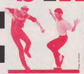
I Dence Jezz. No, Start hasn't gone mad, it's just the name of a group of young dancars who are at the hub of the latest craze. . . . Jazz (that's a couple of them up top). They parform a scorchingly fast hotch-potch of top, braskdancing and ballet with a liberal dash of Northern Soul throw into boot. And in the wake of all this frantic cub activity is the 11-piece.