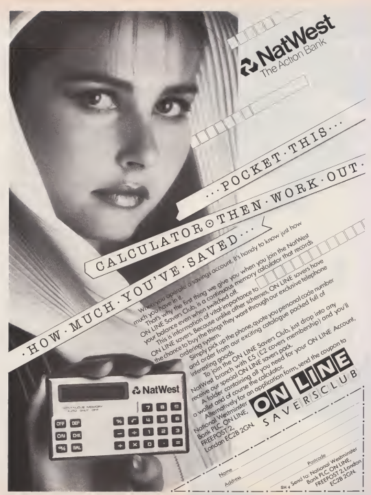
and the goods sciented friction free On Exercision and Net Exercisions (of an 19 Confl Aced Badded Wareholders: This scheme is out bable to any applicant under the age of 19 For community one factors in an Antikas branch