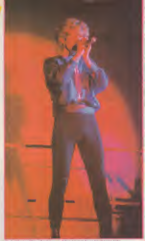
Singing "Carcless Whitsper" and showing off those trousers: "I was determined to do the shuffloocks again because everybody found it so otherstive. Bail tourids 1 get them down These sice parts — or 11 ded i evulutif the abits to get them out again."

The whole band on stage as 7,000 fans scream for a stretches