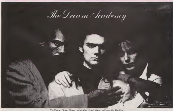
12" - Please, Please, Please Let Me Get What I Want Please, Please, Please (Instrumental Version) - In Places On The Run - The Party (Acoustic Version)