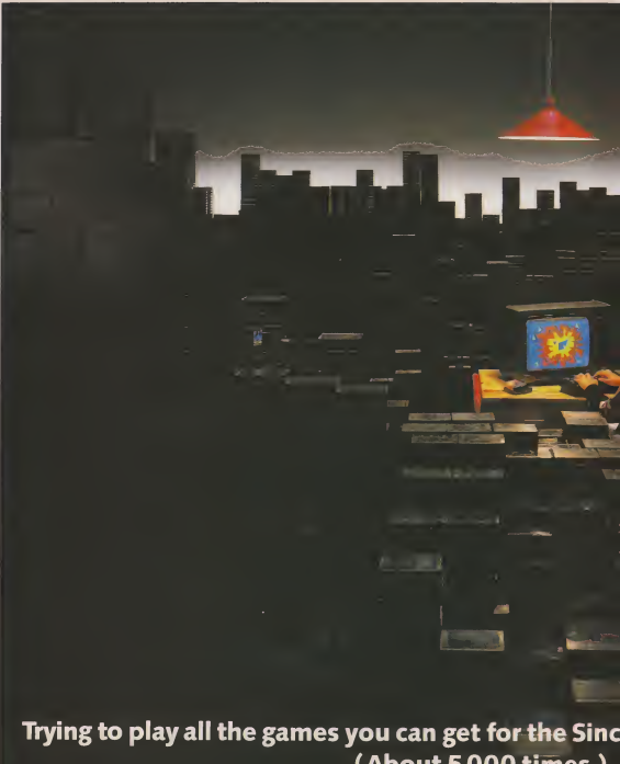
(About 5,000 times.)