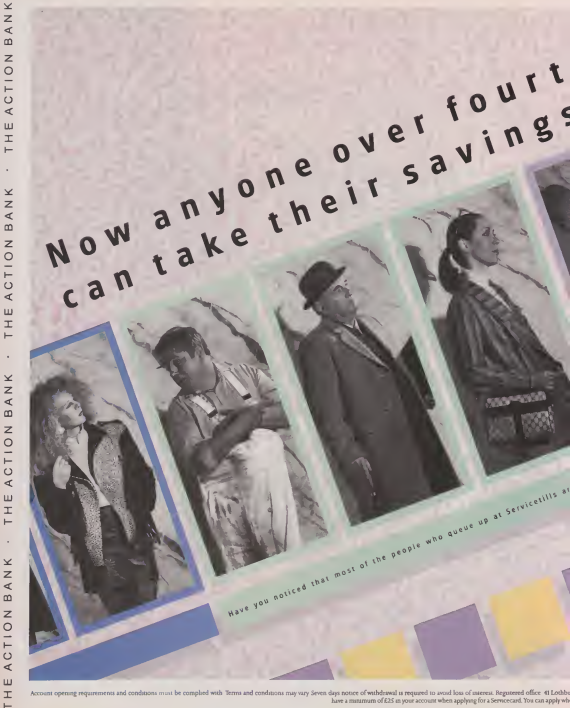
ven days notice of withdrawal is required to avoid loss of interest. Registered office: 41 Lothb