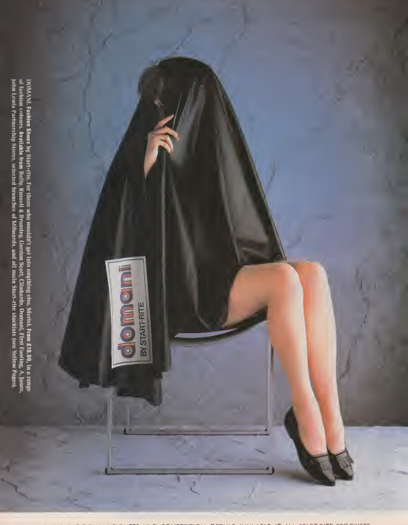
ENTER THE DOMANI/PIONEER HI-FI COMPETITION, DETAILS AVAILABLE AT ALL START-RITE STOCKISTS.