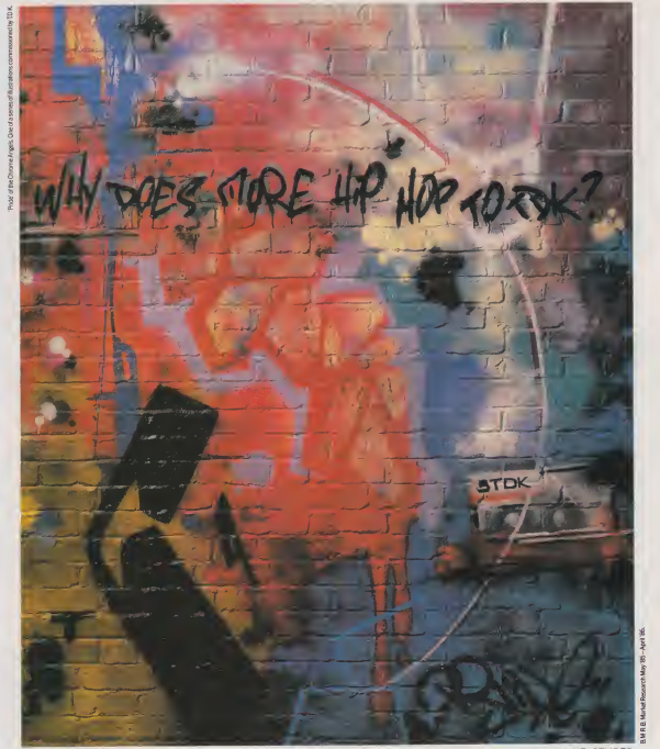
TDK SELLS THREE AUDIO CASSETTES TO EVERY ONE SOLD BY ANY OTHER MANUFACTURER.