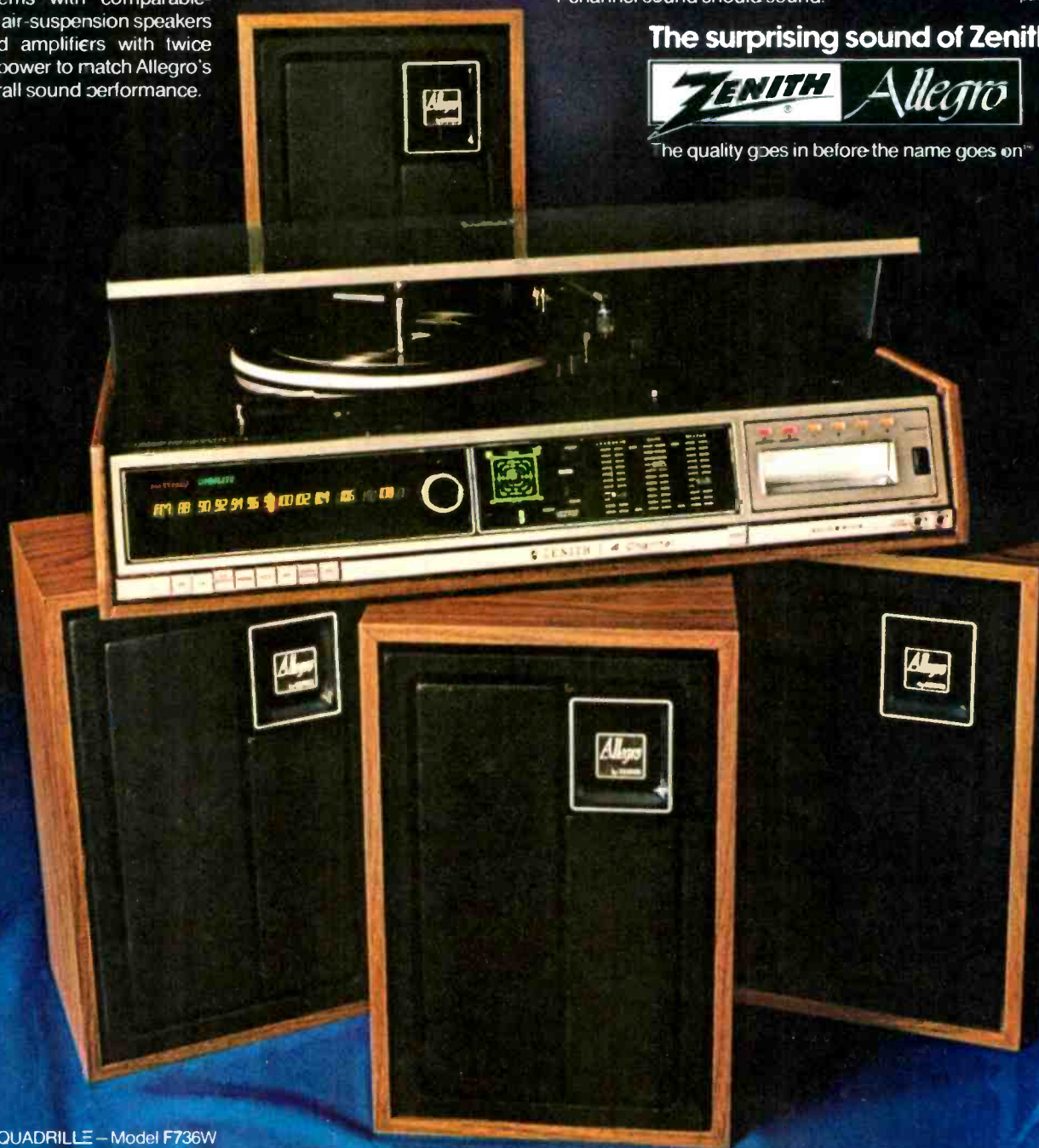
THE QUADRILLE — Model F736W

The quality goes in before the name goes on™