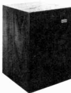
Spendor SA-1 Mini Monitor