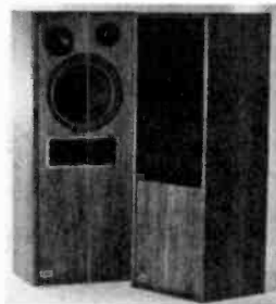
Source Model 4a