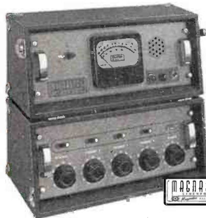
Model G-924 CONVENTIONAL SETUP