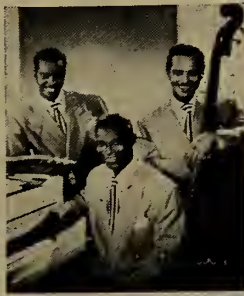
KING COLE TRIO

Ain't no MAYBE about this BABY SHE'S GONNA DEVELOP FAST