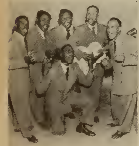
BELLS OF JOY