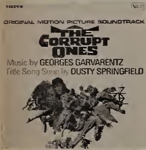
THE CORRUPT ONES —Original Soundtrack—United Artists UAL 4158/UAS 5158