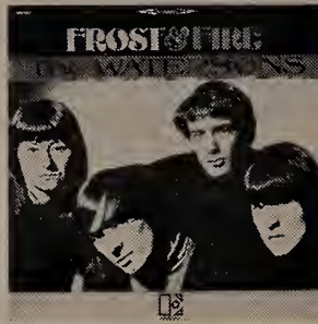
FROST & FIRE —Watersons—Elektra EKL 321/EKS 7321