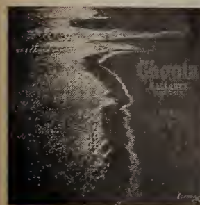
CHOPIN: BALLADES (COMPLETE) —Ivan Moravec—Vanguard Connoisseur Society CM/CS 1266

Pianist Ivan Moravec performs the four ballades of Chopin, which are comprised of "Ballade No. 1, In G Minor, Op. 23," "Ballade No. 2, In F Major, Op. 38," "Ballade No. 3, In A Flat Major, Op. 47," and "Ballade No. 4, In F Minor, Op. 52". Moravec gives illuminating interpretations of the pieces, and the LP should be sought-after by lovers of classical music.