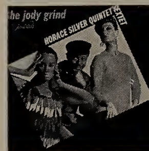
THE JODY GRIND —Horace Silver Quintet/Sextet—Blue Note BLP 4250/84250

The Charles McPherson Quintet offers six soul-stirring jazz numbers on their latest LP. Included in the set are "The Viper," "I Can't Get Started," "Shaw 'Nuff," "Here's That Rainy Day," "Never Let Me Go," and "Suddenly". Could be a lot of chart and sales action in store for this one. Don't let it out of your sight.