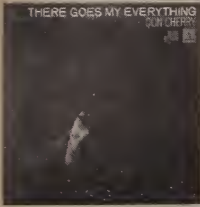
THERE GOES MY EVERYTHING —Don Cherry—Monument MLP 8075/SLP 18075

Don Cherry in a bag of pop goodies. Included on the set are the title tune, "There Goes My Everything," "Lucky Old Sun," and "Serenade Of The Bells." The artist is at the top of his form on the LP, as he delivers his material with effortless ease. The album should please the chanter's many devotees.