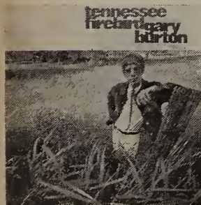
TENNESSEE FIREBIRD —Gary Burton and Friends—RCA Victor LPM/LSP 3719

An interesting and effective blend of jazz and country sounds, this striking album by Gary Burton and Friends could win the approval of an extremely diverse audience. Alternately playing vibes, piano, and organ, Burton leads his group through twelve rousing instrumentals including "Gone," "Just Like A Woman," "I Can't Help It," and "Alone And Forsaken". Deserves close attention.