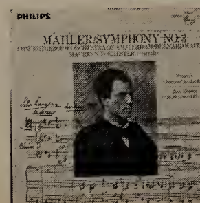
MAHLER: SYMPHONY No. 3 —Haitink/Concertgebouw Orchestra—Philips PHM2-596/PHS2-996

Pianist Ivan Moravec performs the four ballades of Chopin, which are comprised of "Ballade No. 1, In G Minor, Op. 23," "Ballade No. 2, In F Major, Op. 38," "Ballade No. 3, In A Flat Major, Op. 47," and "Ballade No. 4, In F Minor, Op. 52". Moravec gives illuminating interpretations of the pieces, and the LP should be sought-after by lovers of classical music.