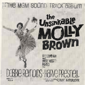
THE UNSINKABLE MOLLY BROWN SOUNDTRACK MGM E-4232 ST Debbie Reynolds and Harve Presnell are heard in the movie version of the long-run Broadway musical hit.