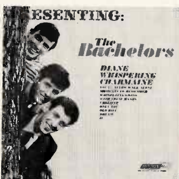
PRESENTING THE BACHELORS London LL 3353 The British group has started moving fast here and the set contains such hot singles as "Diane" and "Charmaigne."