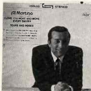
AL MARTINO Capitol ST 2107 The mellow-voiced Martino sings his current hit, "I Love You More and More Every Day" and his newest "Tears and Roses," among others.