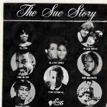
THE SUE STORY VARIOUS ARTISTS Sue LP-1021 Hits by Inex Foxx, Ike and Tina, the Soul Sisters, Baby Washington, Barbara George and others put this in.