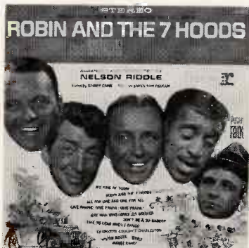
ROBIN AND THE 7 HOODS SOUNDTRACK Reprise FS 2021 Sinatra, Martin, Crosby and Davis do their stuff in this much touted soundtrack set.