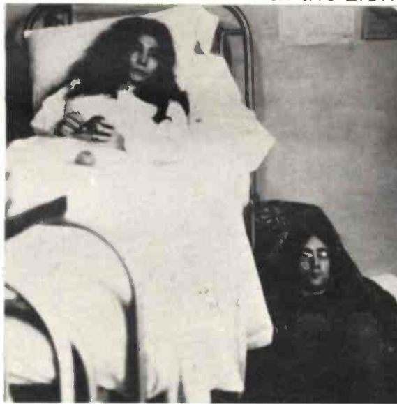
John Lennon/Yoko Ono: (Zapple ST 3357)

One's by John Lennon and Yoko Ono. It's called 'Life with the Lions: