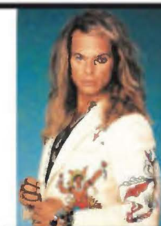
DAVID LEE ROTH, 1990 ▼