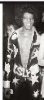
SLY STONE, 1974 ▲