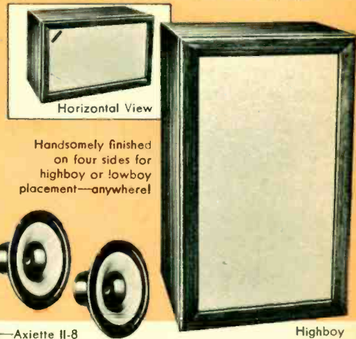
Horizontal View Handsomely finished on four sides for highboy or lowboy placement—anywhere!

AXIETTE II-8 8" HI-FI SPEAKER. Highly efficient, wide-range 8" high-fidelity speaker at moderate cost. Delivers clean, remarkably smooth response over the entire audio spectrum from 30 to 18,000 cycles. Features hyperbolic free edge cone suspension and heavy-duty, die-cast frame construction for optimum performance. Ideal for use in pairs in stereo music systems. Power handling capacity, 15 watts. Resonance, 55 to 65 cps. Requires 7" baffle opening diameter. Impedance, 16 ohms. Depth, 4". Shpg. wt., 5 lbs. 79 D 163. Only $2.00 Down. NET. . . . . 26.46