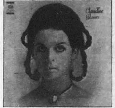
Claudine Longet Colours AML 929 (M) AMLS 929 (S)