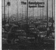
The Sandpipers Spanish Album AML 926 (M) AMLS 926 (S)